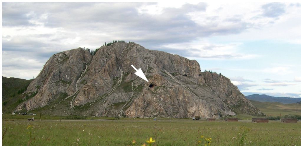
Fig. 1. Location of the Ust'-Kanskaya cave (see the white arrow sign), a karstic cavity in the Silurian limestone deposits in the Čaryš river basin near the settlement of Ust'-kan, Central Altai Mts., Russia.

Only Vespertilionidae bats were found in the locality of the Ust'-Kanskaya cave (Table 1): Plecotus auritus (Linnaeus, 1758); P. aff. auritus ; Eptesicus nilssonii (Keyserling et Blasius, 1839); E. cf. nilssonii ; Vespertilio murinus Linnaeus, 1758; Vespertilio sp.; Murina hilgendorfi Peters, 1880; Myotis blythii (Tomes, 1857); M. petax Hollister, 1912; Myotis sp. and M. cf. schaubi Kormos, 1934.