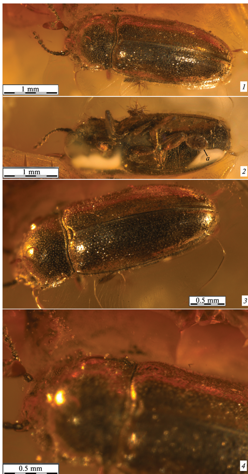
Fig. 1. Cryptophagus harenus Holotype (SIZK K-8224, Klesov, Rovno amber, Late Eocene): 1 — body, dorsal; 2 — body, ventral ( a — mite); 3 — elytrae; 4 — front part, dorsal.

Рис. 1. Cryptophagus harenus голотип (инв. номер К-8224 коллекции Института зоологии НАН Украины, Киев, Клесов, ровенский янтарь, поздний эоцен): 1 — вид сверху; 2 — вид снизу ( a — клещ); 3 — надкрылья; 4 — пронотум сверху.