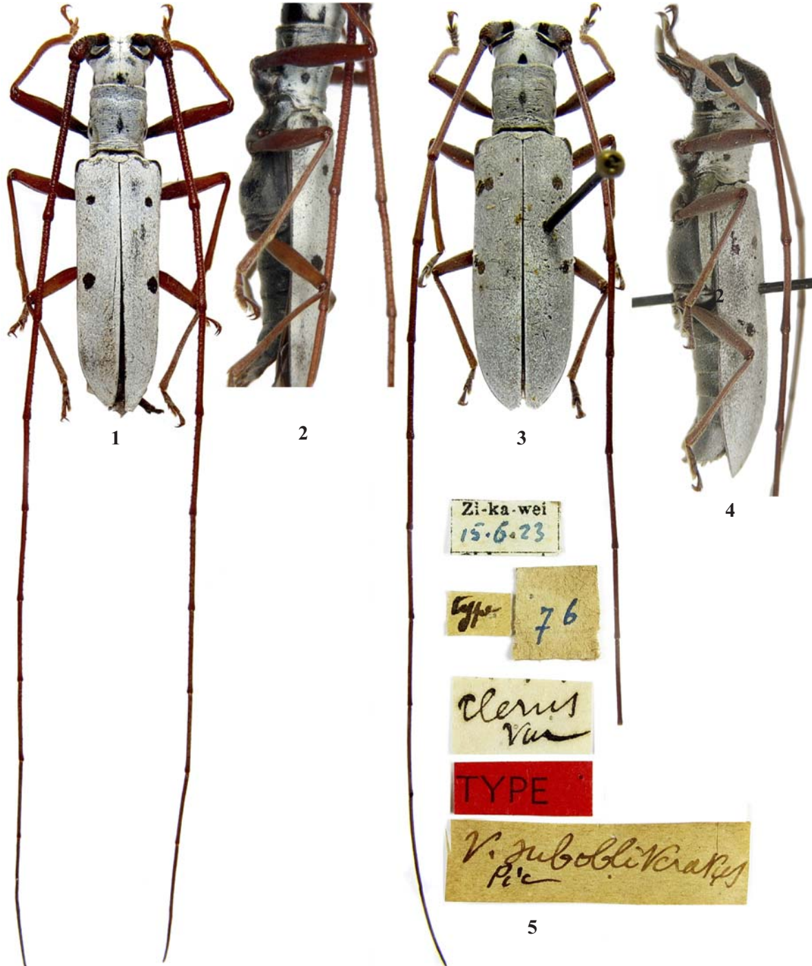
Figs 1–5. Olenecamptus spp.: 1–2 — O. riparius , sp.n.; 3–5 — O. subobliteratus ; 1–2 — male, holotype; 3–4 — female, holotype; 5 — holotype, set of labels; 1, 3 — dorsal view; 2, 4 — lateral view.

According to the personal message (followed by corresponding photos) by M. Lin, several specimens O. subobliteratus are preserved in the collection of National Zoological Museum of China (Beijing): 4 ♂♂, 2 ♀♀, Kiangsu (Jiangsu), Shanghai, Zi-ka-wei, 12.7.1920–18.6.1925; 1 ♀, Zhejiang, Yangzhou, 1936; 1 ♂, Beijing, Daxing, Lixian, 11.7.1971; 1 ♂, Beijing, Xiangshan, 8.7.1948, leg. Wang