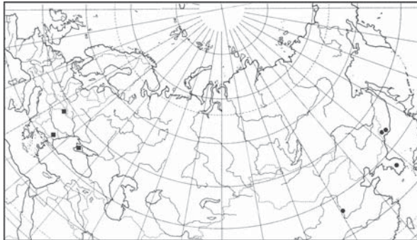
Fig. 5. Distribution of the genus Paratrachelas : square — P. maculatus ; dot — P. acuminus .

Рис. 5. Распространение рода Paratrachelas : квадрат — P. maculatus ; точка — P. acuminus .