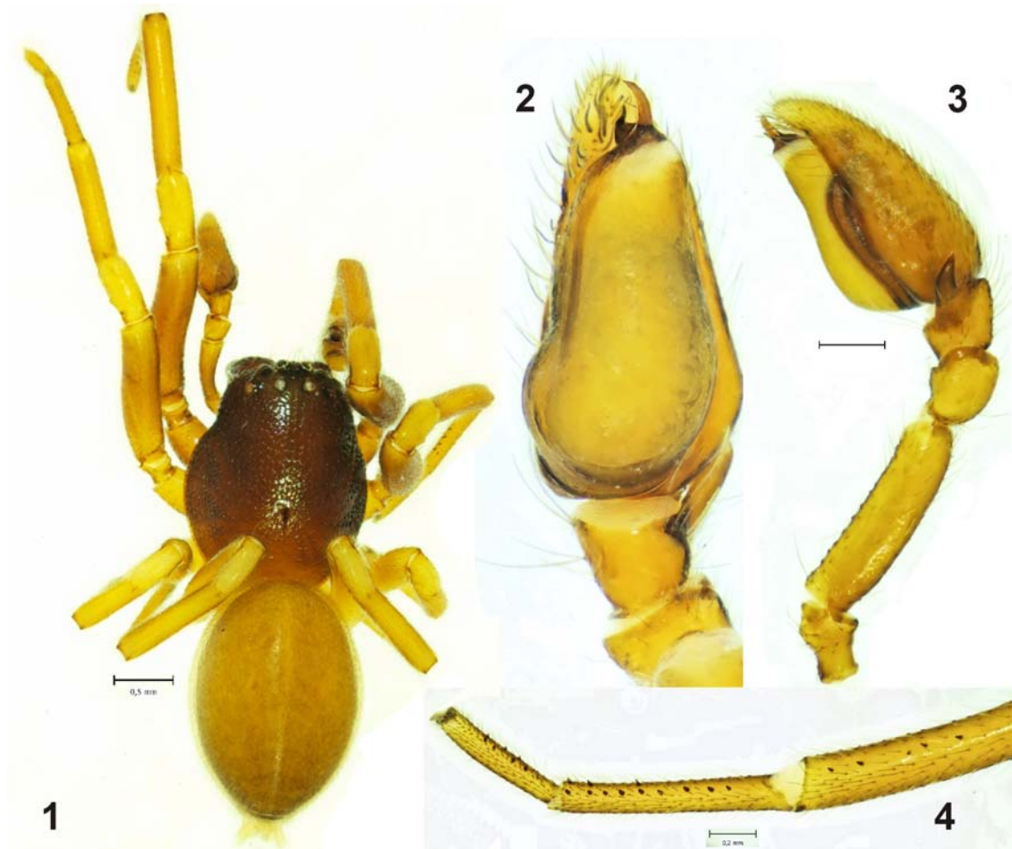
Figs 1–4. Male of Paratrachelas acuminus : 1 — body, dorsal; 2 — palp, ventral; 3 — whole palp, retrolateral; 4 — leg I ventral showing cusps.

Рис. 1–4. Самец Paratrachelas acuminus : 1 — габитус, сверху; 2 — пальпа, снизу; 3 — вся пальпа, ретролатерально; 4 — нога I снизу, показаны шипики.