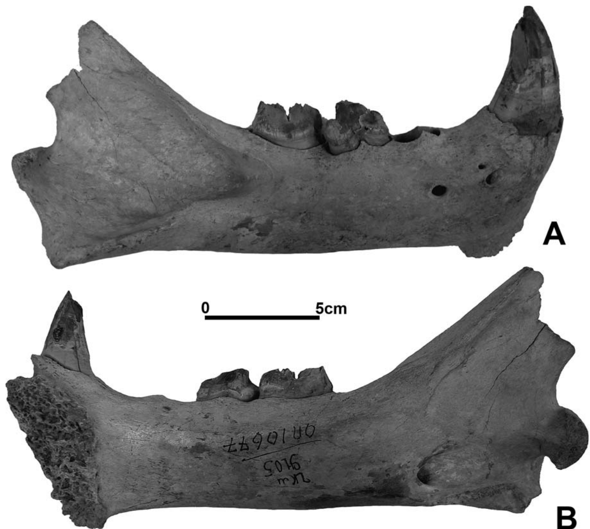
Figure 1. Mandible of Panthera spelaea spelaea from Chuvashiya (unknown locality), CHNM 9105, in labial (A) and lingual (B) view.

gin of the mandible below the lower carnassial tooth m1 is weakly convex, which is characteristic of the cave lion (Vereshchagin, 1971). The ratio between the m1 length and the length of c1–m1 row is 38.7%.