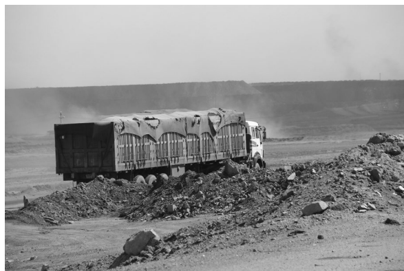
Fig 1. View of Tavan Tolgoi mine.

We selected a field site for small mammalian community research at 100–500 m away from the Tavan Tolgoi coal mine site (Fig. 1) in Tsogttsetsii soum (N43°42'59", E105°28'40", elevation 1502 m a.s.l.). We also selected a site of small mammals at 100–500 m from the Oyu Tolgoi copper-gold mining area in Khanbogd soum of South Gobi province (N43°01'57", E106°47'15", elevation 1203 m a.s.l.). These sites