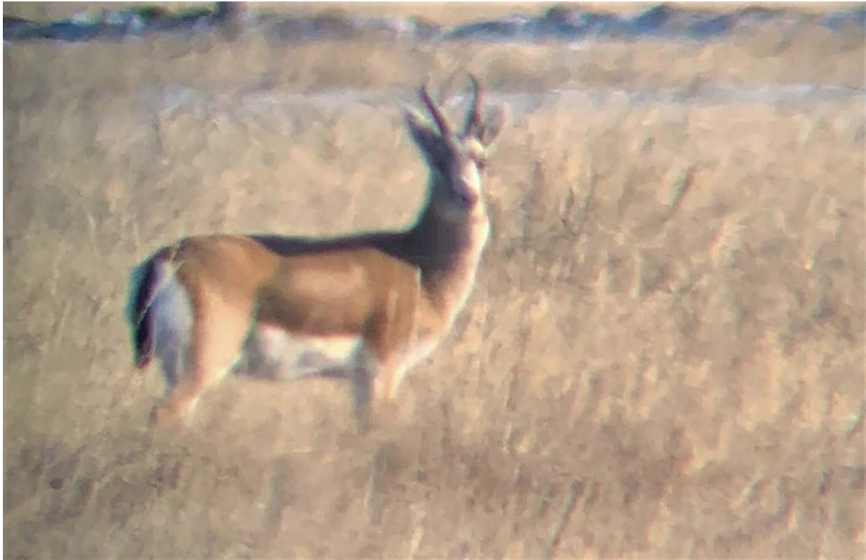
Fig. 3. Adult male of Goitered gazelle in Transbaikalia, Solovievsk, 11 January 2020, 49.93°N, 112.867°E, photo by Petr Khramov.

to assess forage supply for wild ungulates. Habitats of both species in Mongolian territories underwent a striking change with the loss of feeding ability as a result of droughts and overgrazing by livestock, which numbers increasing from 30 000 000 to 71 000 000 animals between in 2000 and 2019 (Mongolian Statistical Information Service). Another factor is the disturbance of Mongolian gazelles by people and domestic dogs. This influence lesser in Zabaikalsky Krai than in Mongolia (Kirilyuk, unpubl.) that supposedly can also determine gazelle expansion from Mongolia into Russia. The emerging signs of the rapid relocation of the Mongolian gazelle into Russia is a great threat to transboundary migratory groups and may be a harbinger of the global population's vulnerability. Development of monitoring system to track the main population parameters and adoption of long-term conservation measures are extremely urgent.