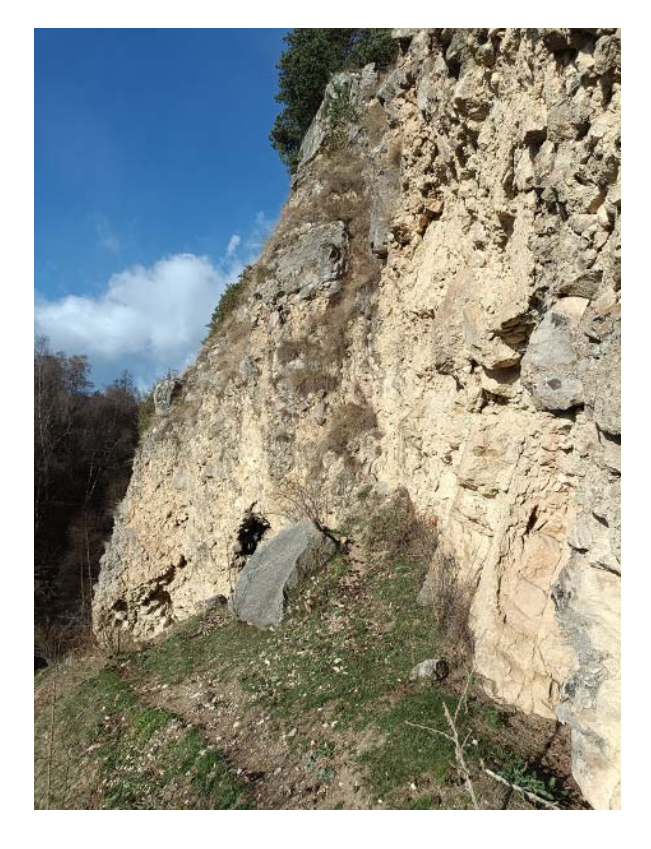
Fig. 1. Habitat, where the rock shrews were found.

White-toothed shrews of the "pergrisea" complex have not previously been recorded on the northern macroslope of the Caucasus Mountains. Our data extends the distribution range of this complex northward across the Main Caucasus Range. Most likely, the distribution of this species in Dagestan is not limited to the vicinity of Gunib only. Considering that "pergrisea" shrews are petrophilic and xerophilic, they should be looked for in appropriate habitats. Two xerophilic refugia are known in Dagestan (Mazanaeva & Tuniev, 2011). The first one is located on the Caspian shore, where habitats biotopes are absent. The second one includes semiarid mid-mountain basins between the Bokovov and Ska-